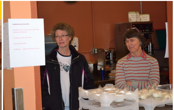
Unless you just came for the coffee and goodies