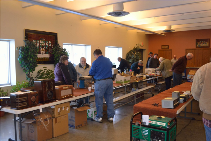
The goods—what it's all about